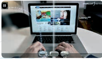
Personalized Lens Demos